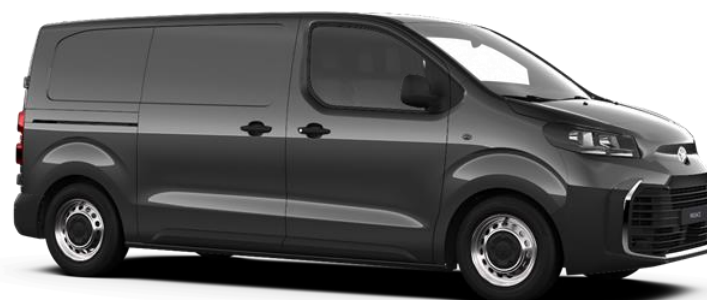
Titanium Grey (KKJ)