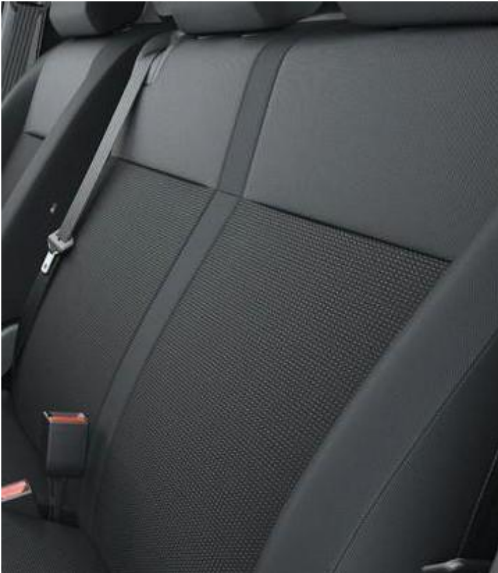
Dark grey fabric

Available in dark grey fabric with a unified black instrument panel that delivers a fresh image.