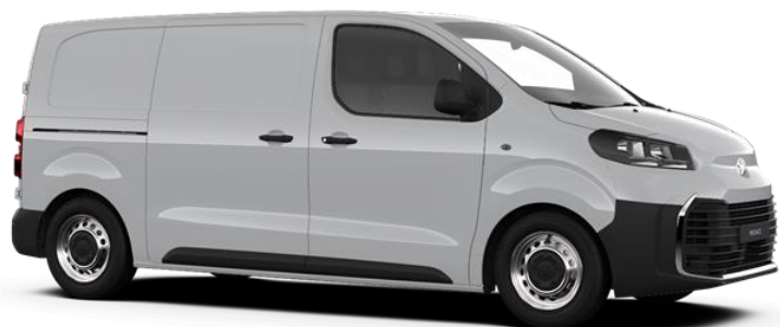
Icy White (EPR)