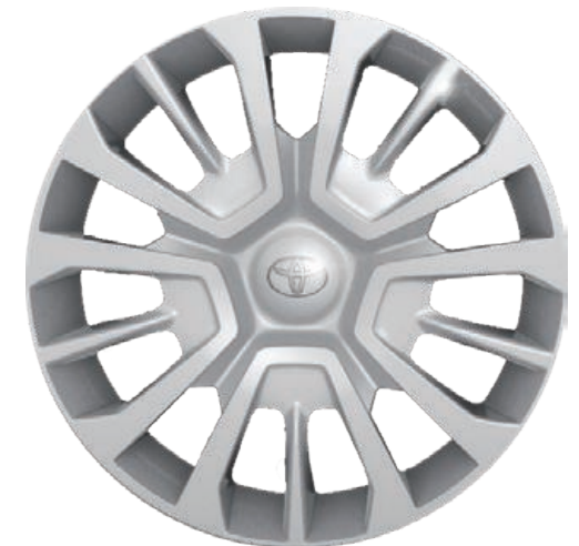
GX-Camera & Colour Pack