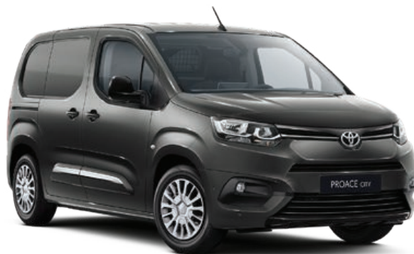
Dark Grey (EVL)